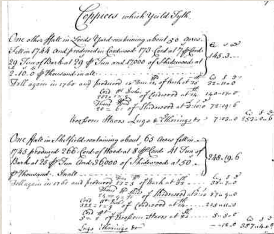
Fig 1 Copy of page 47 of the original data for Lord's Yard (50 acres, 1744, 1760), and Sheffield coppice (65 acres, 1745, 1761).

in a cottage, now demolished, at the top of Wyre Hill, Bewdley, told me about 1969, that he could get 6 hundredweight of charcoal from a ton of wood. So the hundreds of years of coppicing continued until recent times, before passing from living memory.