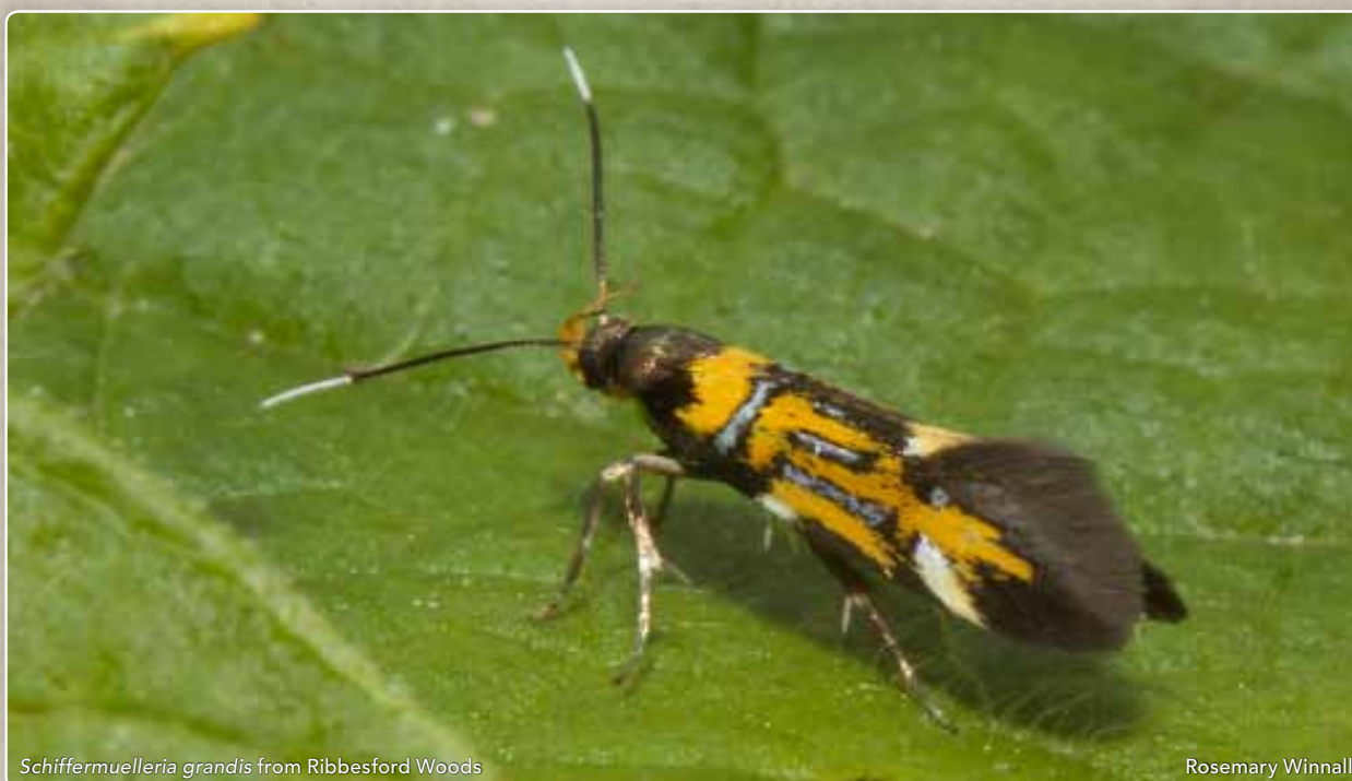
Schiffmuelleria grandis from Ribbesford Woods