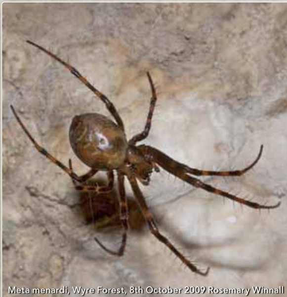
Meta menardi, Wyre Forest, 8th October 2009

This is a species that may well be overlooked because of the nature of where it lives. There are not many people who wish to explore these dark places, particularly if there are large hairy creatures lurking with the desire to entangle!!