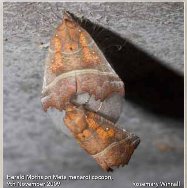
Herald Moths on Meta menardi cocoon, 9th November 2009